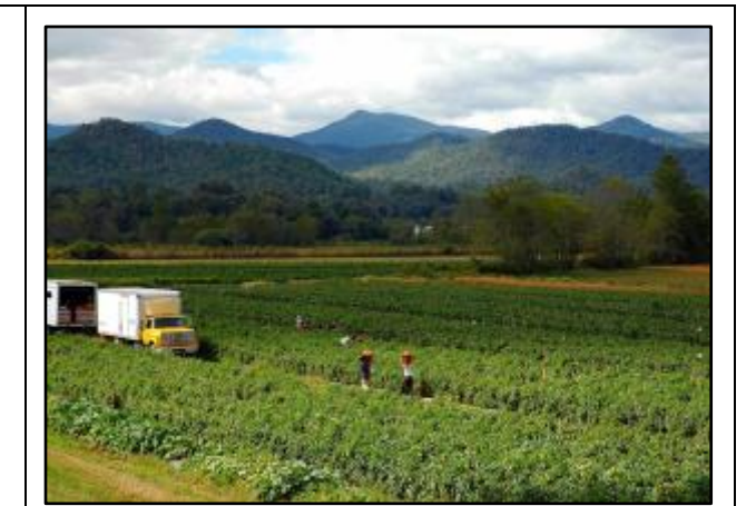
This clearinghouse of information and tools integrates the societal value of ecosystem benefits with future threats to inform planning and management.

This modeling effort identified ecologically significant landscapes and corridors of connectivity that are critical to conserving regional biodiversity into the future. The final design framework will provide public land managers, nonprofit organizations, and private landowners the ability to incorporate landscape data into local decisions and conservation actions.