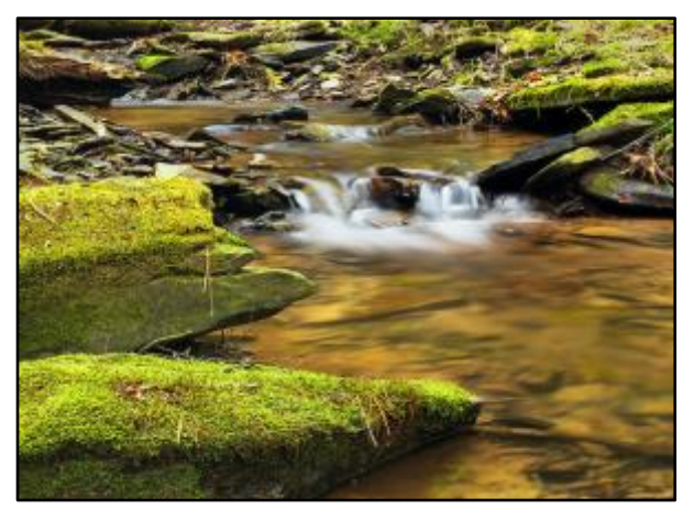
A balance between human needs and flows needed to sustain aquatic ecosystems can be realized if water withdrawal regulations vary with stream size and season.

Stream Impacts from Water Withdrawal Research Page - <u>http://applcc.org/research/stream-impacts-</u> water-withdrawals